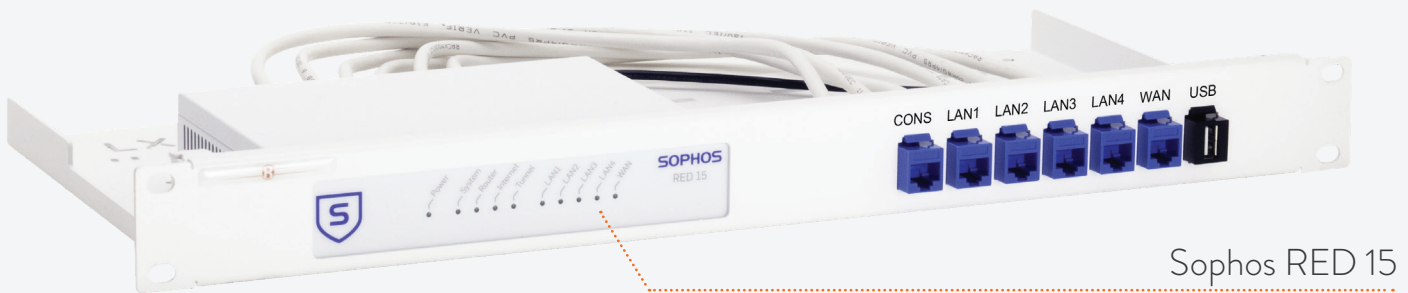
Sophos RED 15